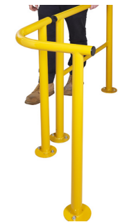
Corner Guard Barrier