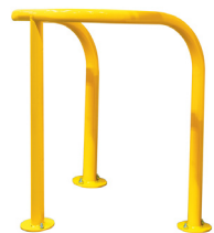
Pillar Guard Barrier