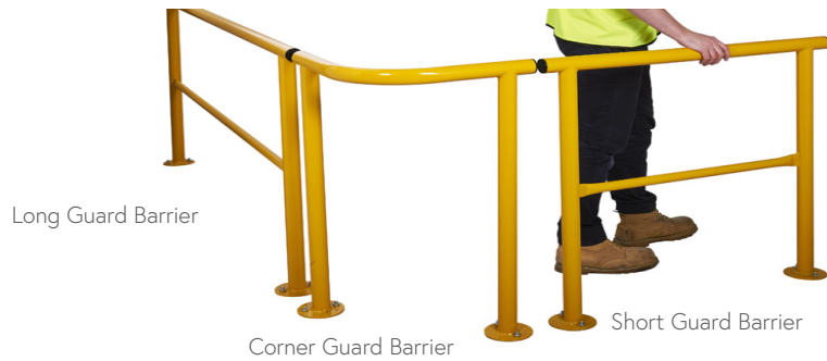
Long Guard Barrier