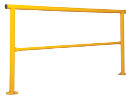
Long Guard Barrier